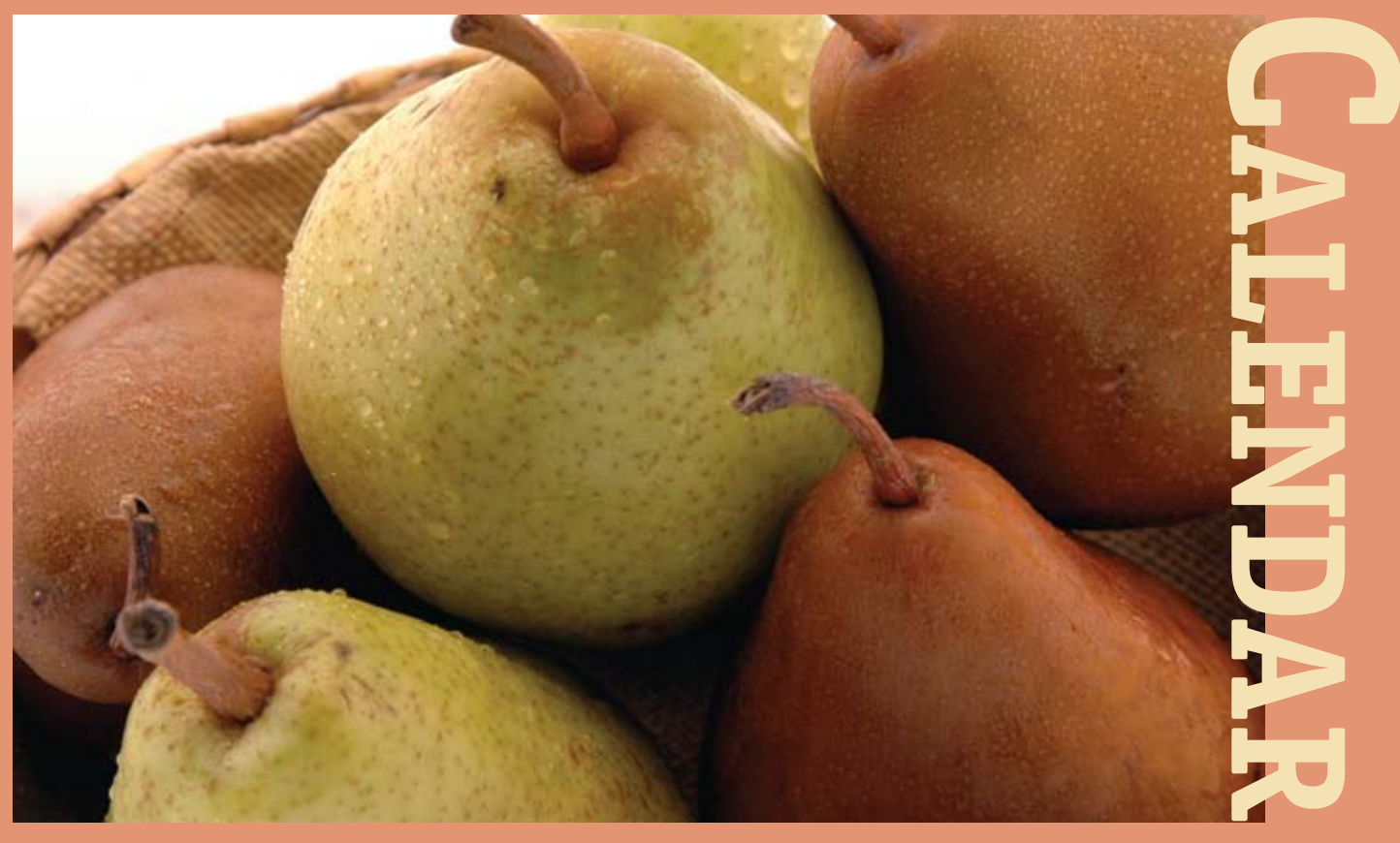
HARTFORD HOSPITAL PROGRAMS & EVENTS FROM SEPTEMBER 15 THROUGH DECEMBER 15, 2010